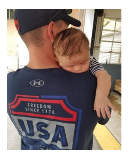
Hurry up with the speeches, please!