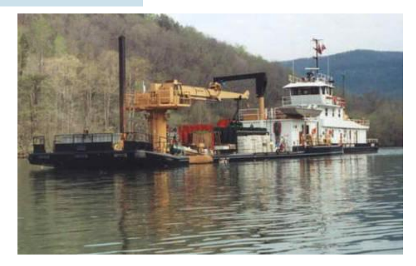
USCGC OUACHITA (WLR-65501) maintains aids to navigation along a 619-mile stretch of the Tennessee River and its tributaries