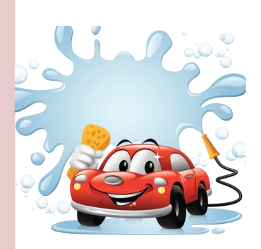
No Wash Today

Other events coming up in the fourth quarter are: November 13, 2021 - Marine Corp Ball, December 1, 2021 – Board Meeting, December 2, 2021 - Membership Dinner Meeting, and December 18, 2021 - Laying of Wreaths Across Chattanooga at the National Cemetery.