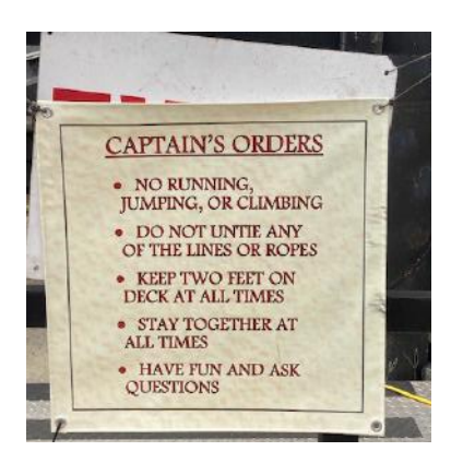
Just like the Navy....!